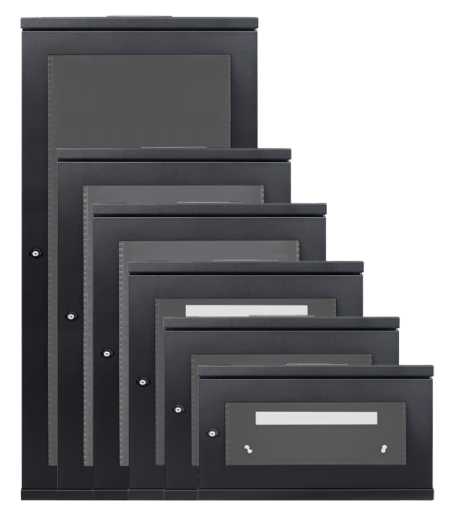
Six Heights 6U, 9U, 12U, 15U, 18U, 27U

©2023 Karis Technologies. All rights reserved. Karis Technologies™ and the Karis Technologies logo are trademarks or registered trademarks of Karis Technologies. All other names and logos referred to are trade names, trademarks or registered trademarks of their respective owners. While every precaution has been taken to ensure accuracy and completeness here. Karis Technologies assumes no responsibility, and disclaims all liability, for damages resulting from use of this information or for any errors or omissions. Specifications, rebates and other promotional offers are subject to change at Karis Technologies' sole discretion upon notice