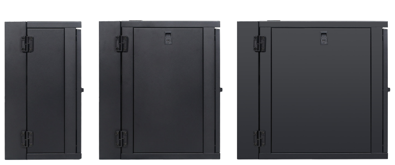
Three Depths 12" (300mm), 22" (550mm), and 30" (750mm)